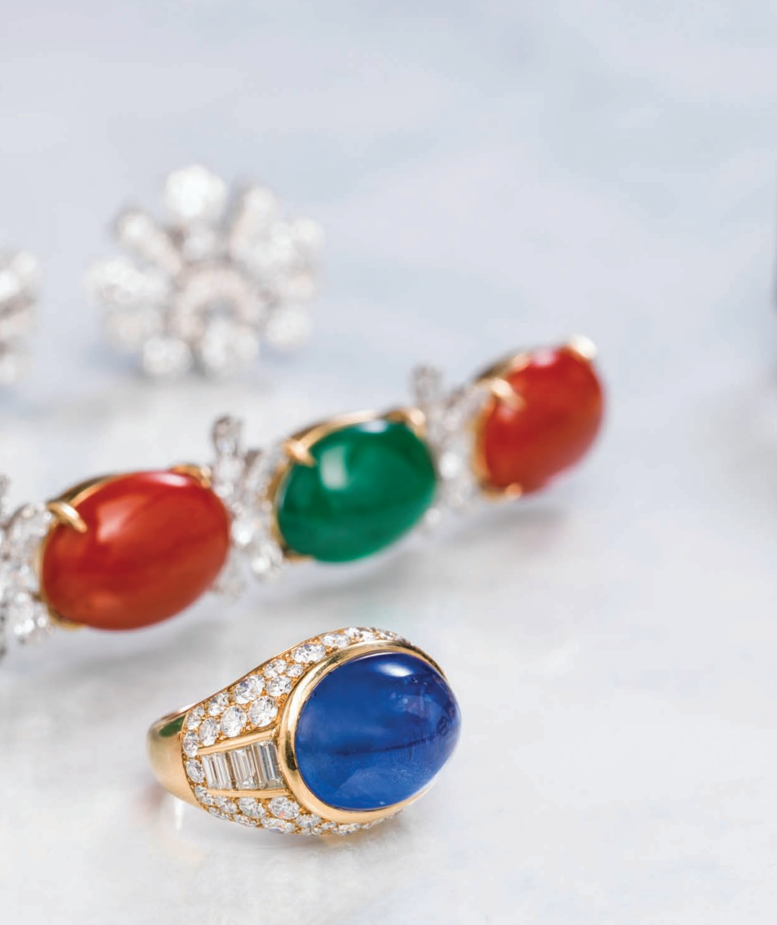
Illustration featuring lots 511, 542, 544, 571, 600, 620 all by Bulgari.